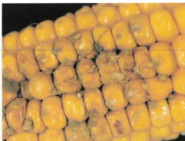
Figure 2. Aspergillus flavus spores on damaged corn kernels.