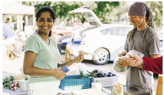
Innovative community food system investment in action! At Cottin's Hardware Farmers Market in Lawrence, KS, a shopper uses Double Up Food Bucks tokens to buy fresh, healthy local food. The program allows shoppers using SNAP (food stamps) to get twice the value of their benefit thanks to public-private funding. doubleupheartland.org